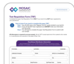
Test Requisition Form